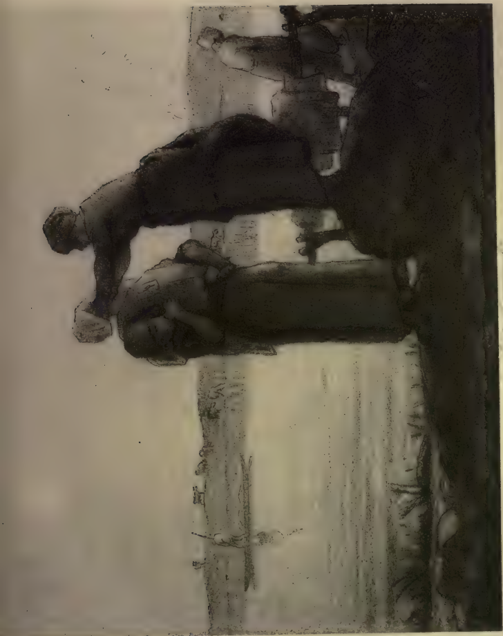
Les Savandières (The Washerwomen)